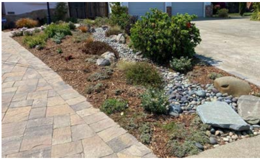
The ' Secret Garden '

Assisting PUC and Recreation and Parks, our team has been hard at work planting and nurturing the hillside at Stern Grove.