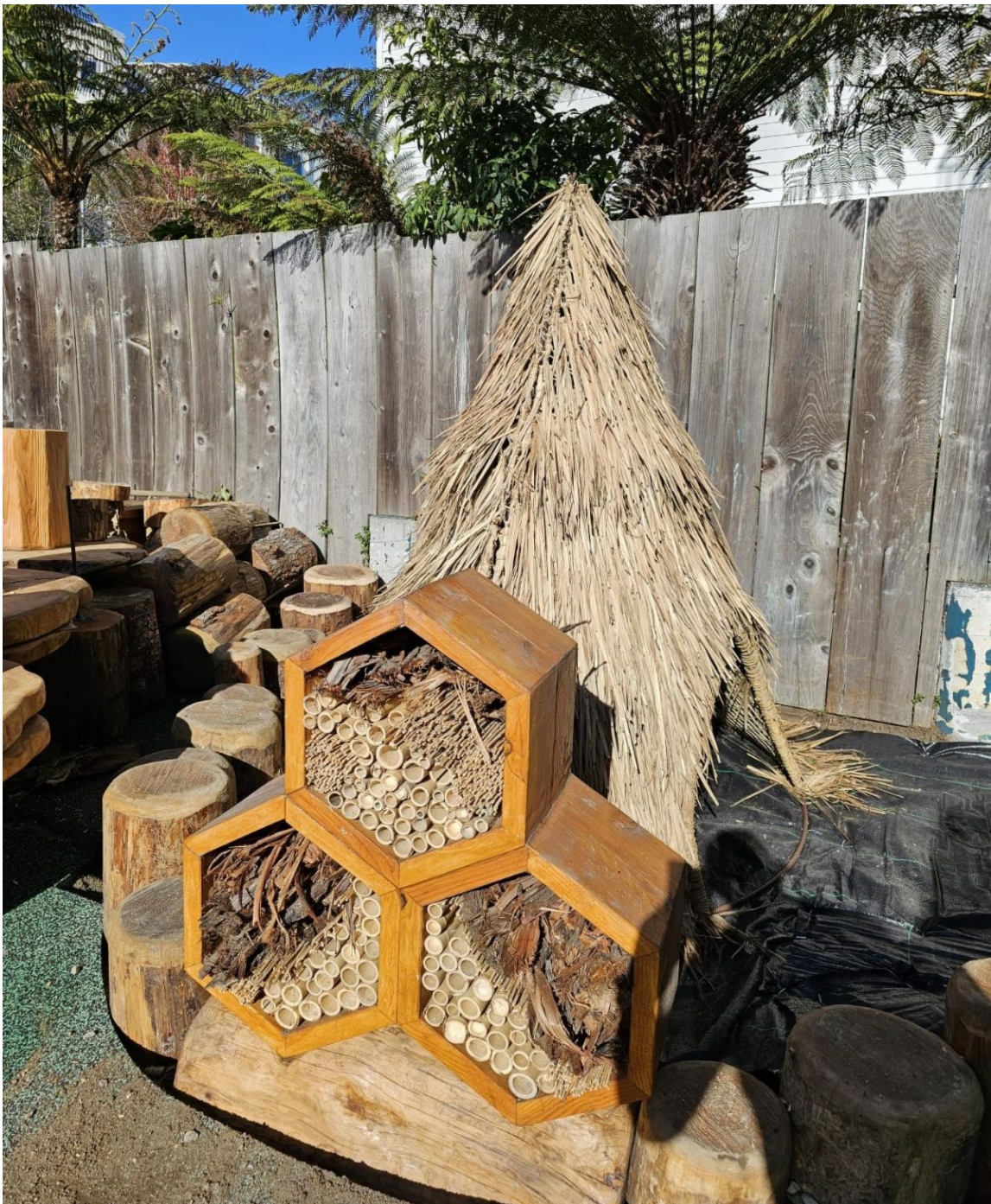
Friends of St. Francis - Bug Hotel and Hut Made with Monterey Cypress and packed with bamboo, bark and twigs.